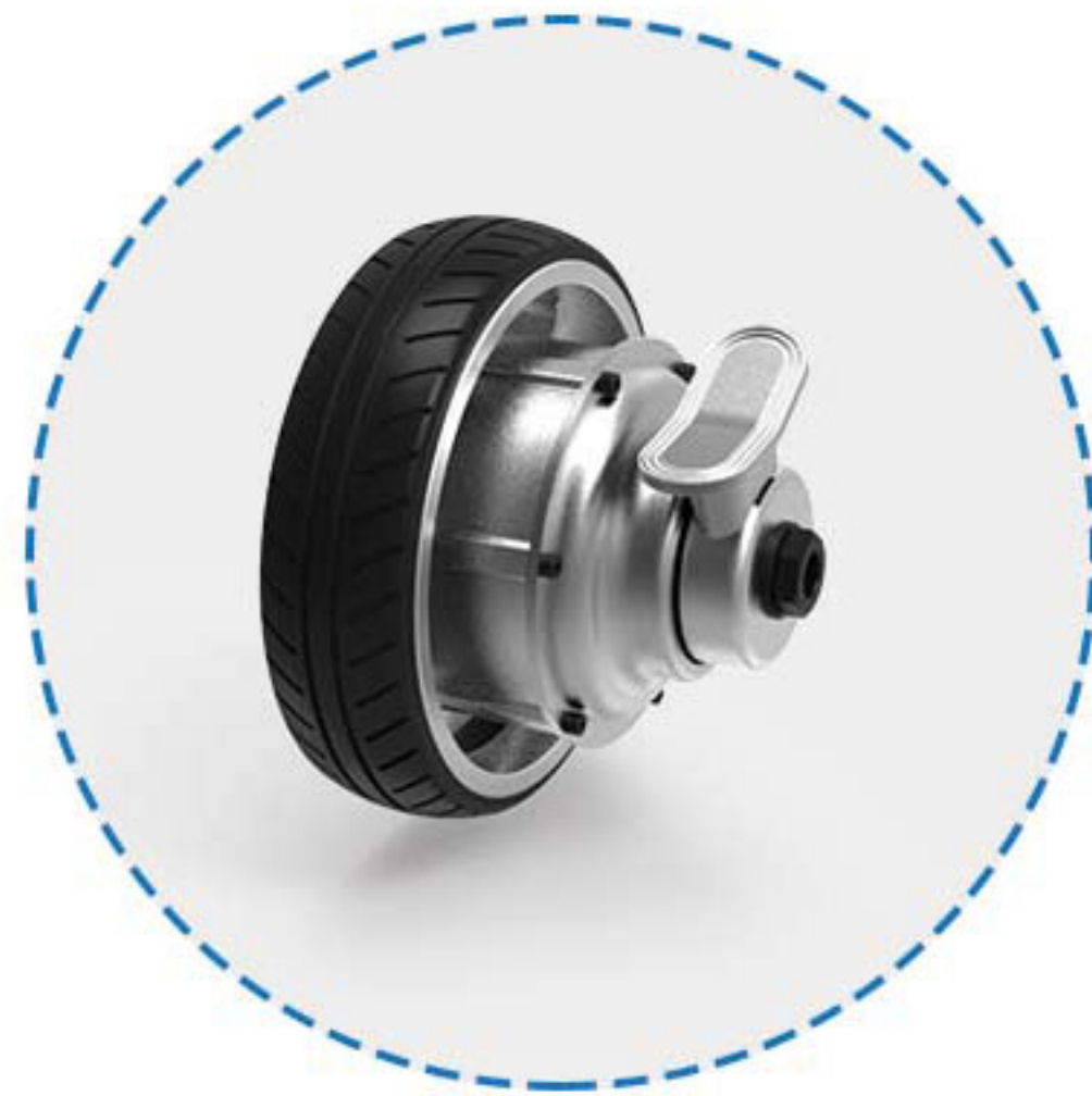
High torque hub motor