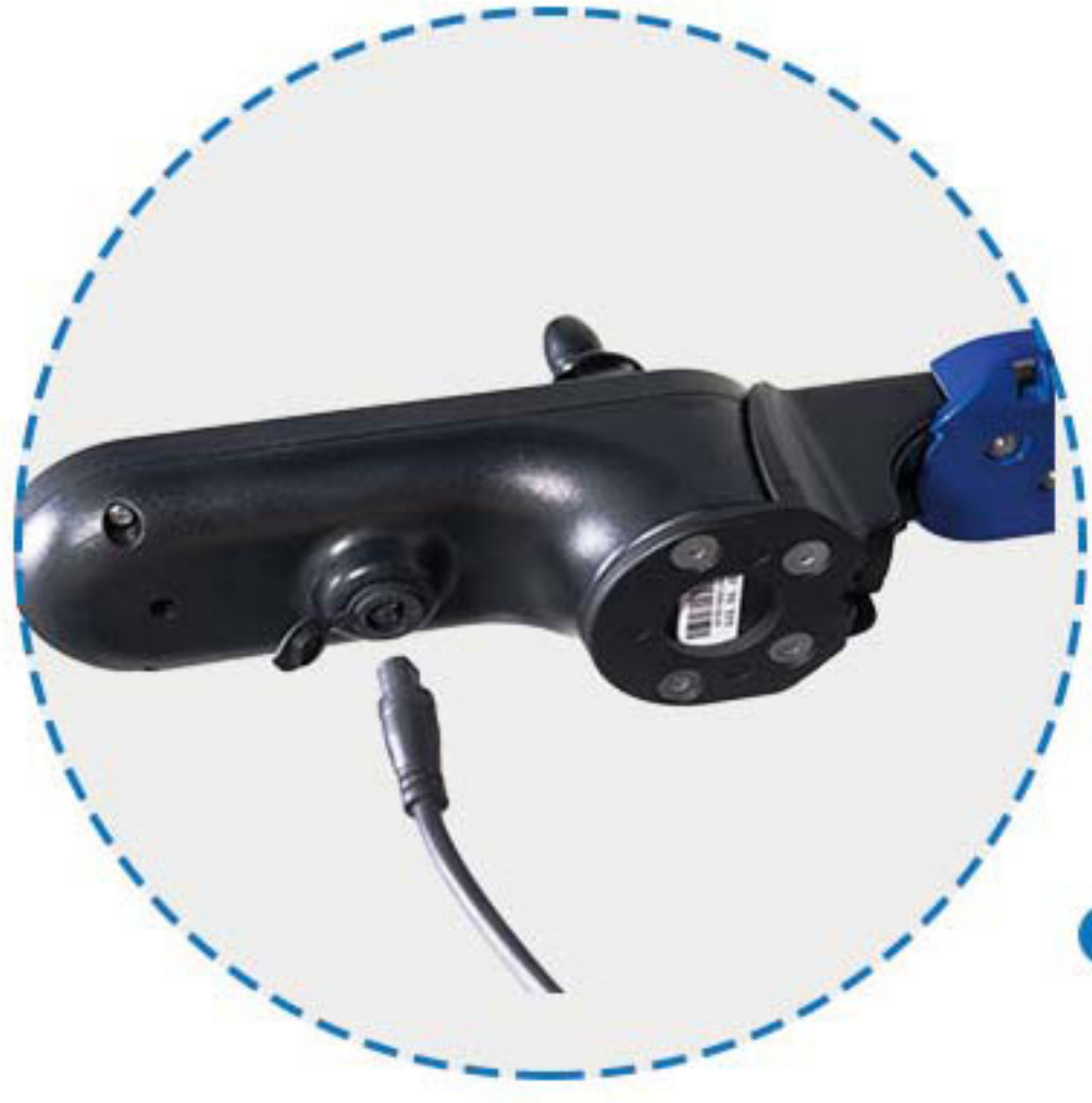
Dual charging port