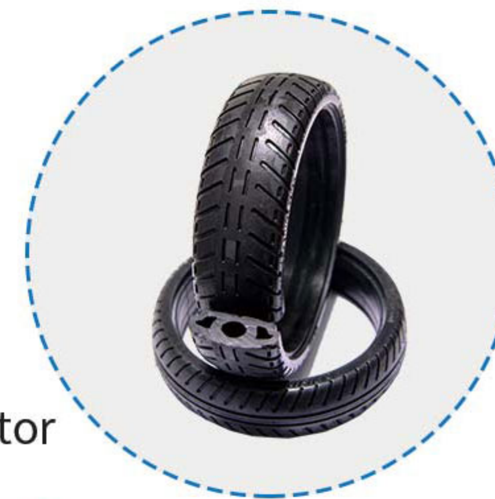
Non-pneumatic rubber tyre