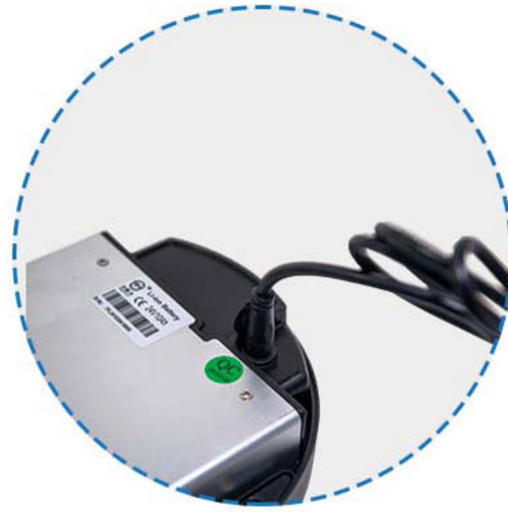
Dual charging port